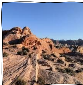
Valley of Fire