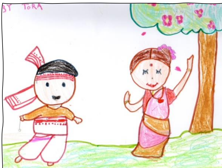
'Bihu' - Art by Tora Deka

Tora is in Kindergarten at Old Yale Elementary School, British Columbia, Canada.