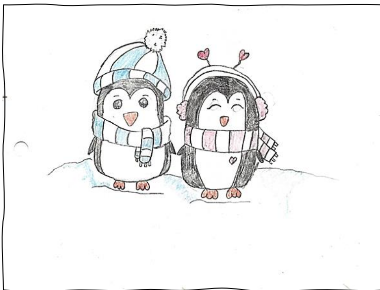
'Happy Winter' - Art by Rwxita Bordoloi

Tora is in Kindergarten at Old Yale Elementary School, British Columbia, Canada.