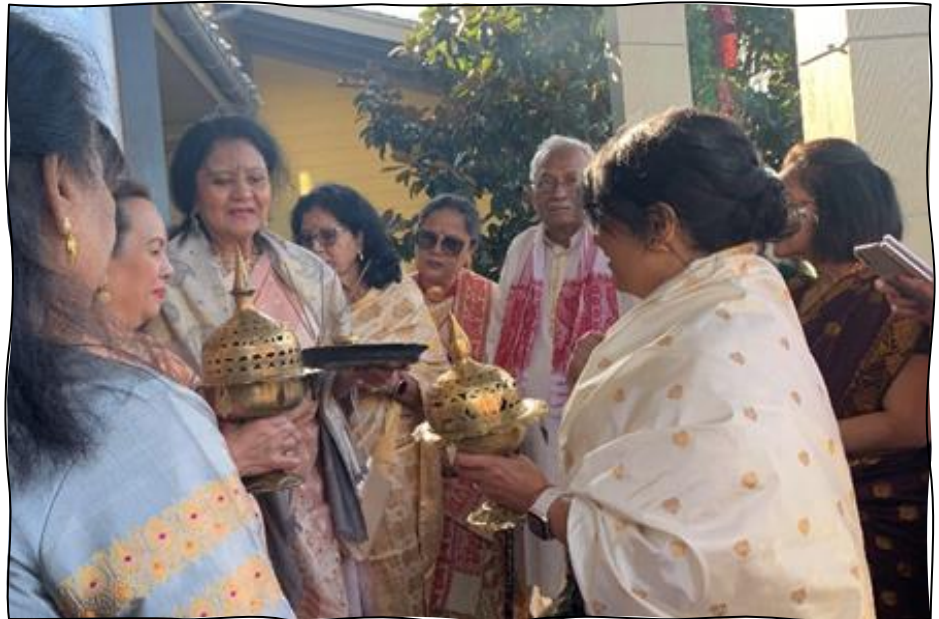
Beautiful mother of the groom greeting the beautiful mother of the bride.