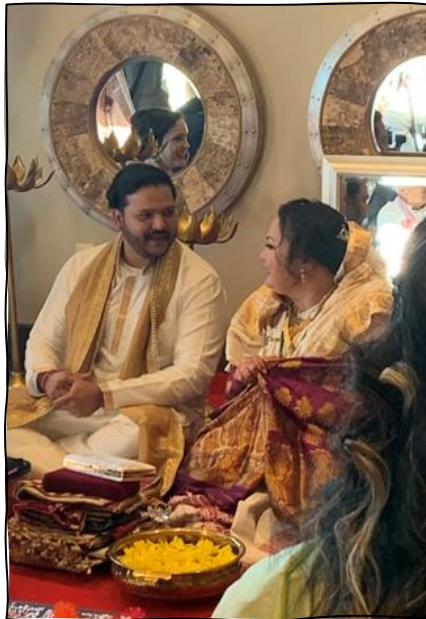
Gorgeous Juroon marking the beginnings of the family union. The joy in their eyes was contagious!