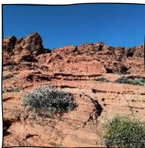
Valley of Fire

We went deeper into the park until we came to the Arch rock in the Valley of Fire. The arch is a bridge of natural formation. It is a two-mile scenic loop in a rock. As we took pictures beside it, I suddenly became aware of the flora around us. I noticed a cactus plant with other desert plants. As I photographed it, a lizard suddenly sizzled past us. The lizard was not the only reptile we saw of animal life. Down the road, a herd of mountain goats climbed the rocks and stood unafraid among hordes of curious park travelers taking pictures of it. Our journey ended when we reached Meade lake. We returned after viewing the splendid white and red rock formation there. On our way back we said goodbye to the untouched beautiful landscape that only God had sculptured, a gift that America is indeed fortunate to hold.