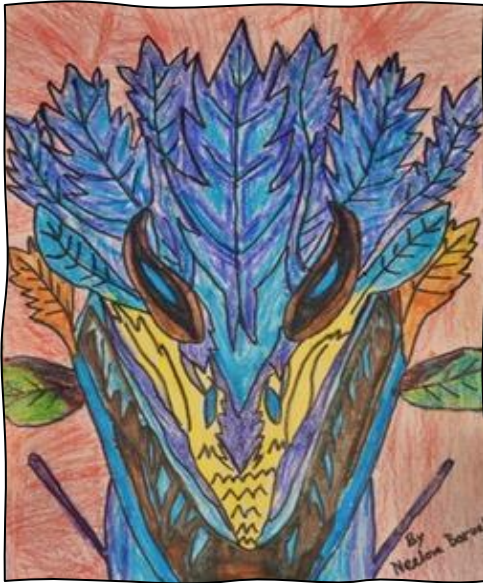
A Dragon Head